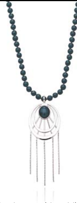
FAME. Beautiful contemporary interpretation of a peacock plumage, for the unique and daring woman: this pendant combines silver feather holding with an iridescent blue mabe pearl.