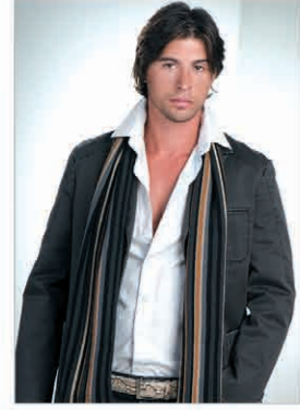
art.# 61 013