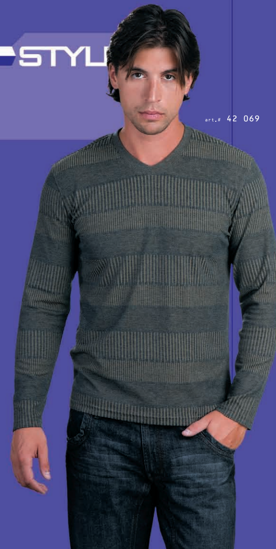
art.# 42 069