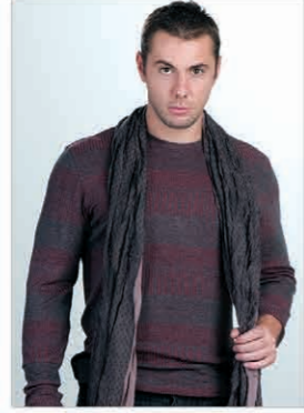
art.# 42 065