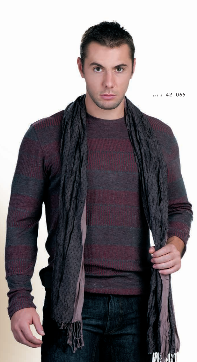
art.# 42 065