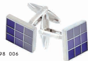
art.# 98 006