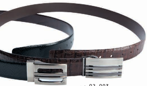
art.# 02 003