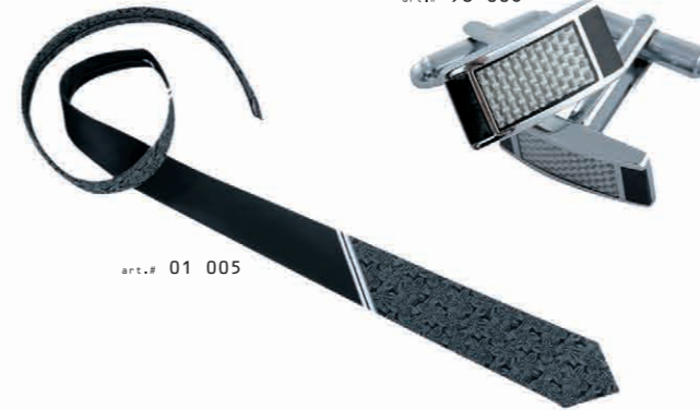
art.# 01 005