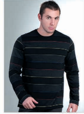
art.# 39 136