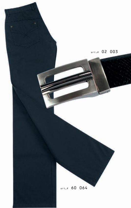
art.# 02 003