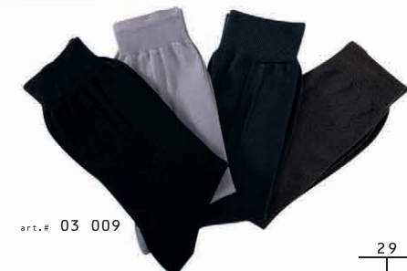
art.# 03 009