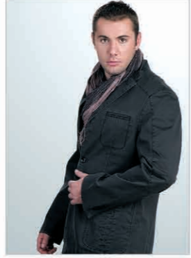
art.# 61 013