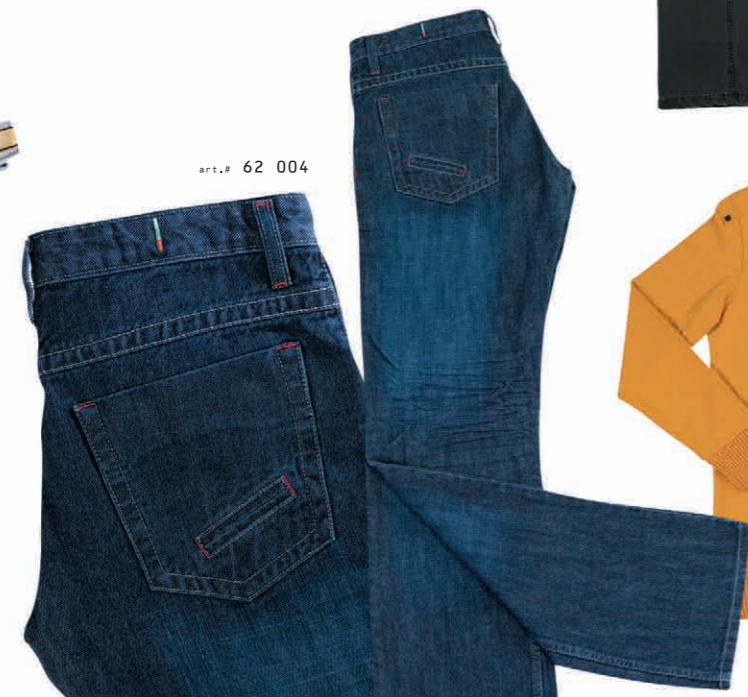
art.# 62 004