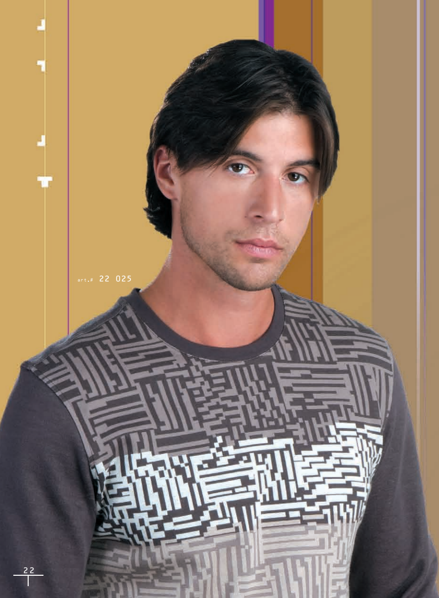
art.# 22 025