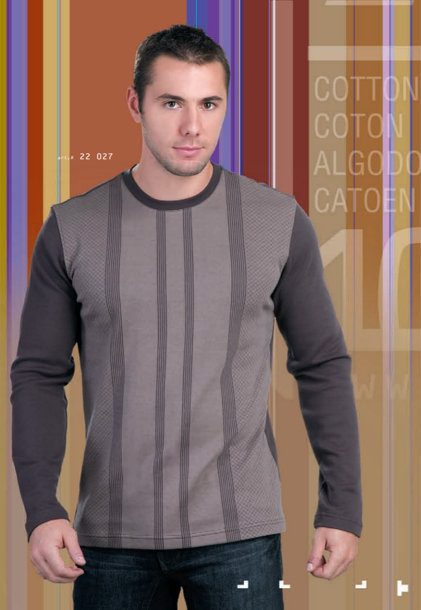
art.# 22 027