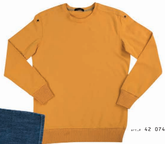
art.# 42 074