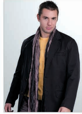
art.# 61 011