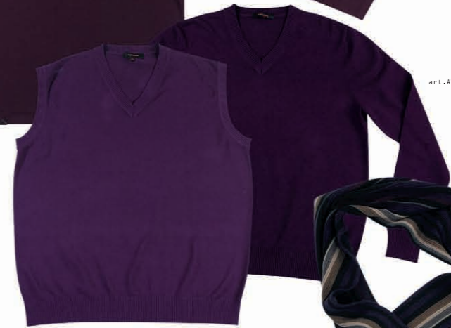
art.# 14 048