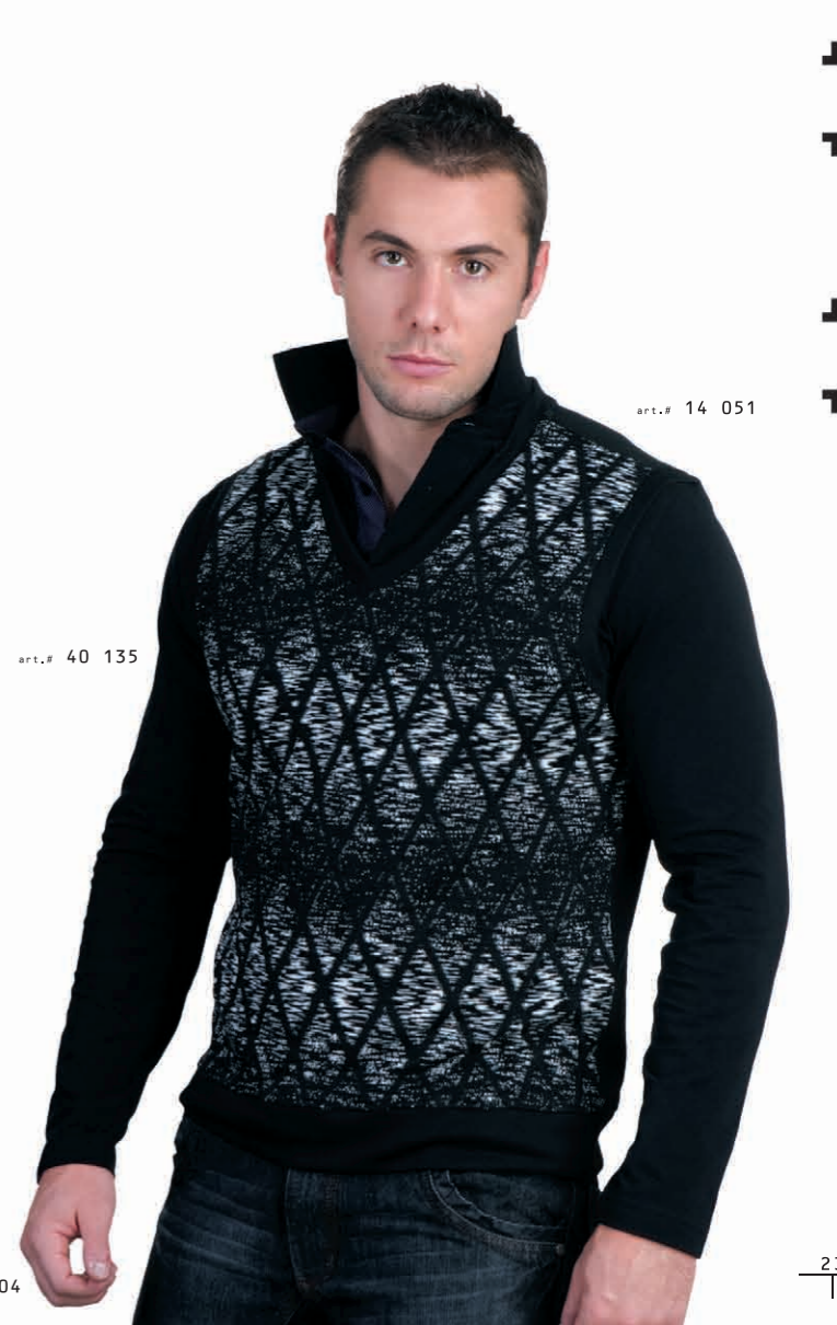
art.# 40 135