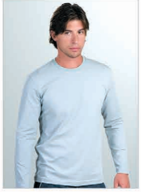
art.# 39 145