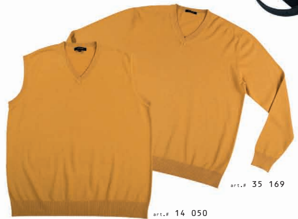
art.# 35 169