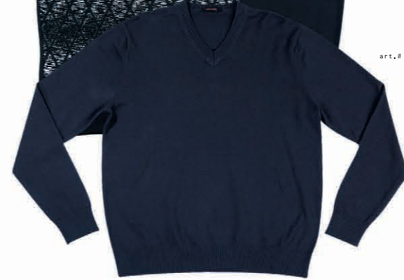
art.# 35 167