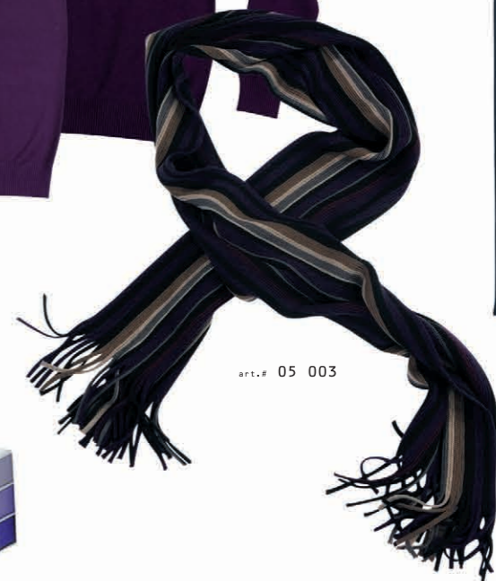
art.# 05 003