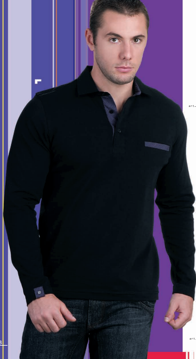
art.# 40 135