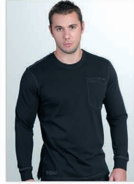
art.# 39 150