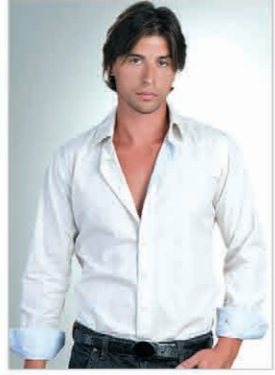
art.# 21 003