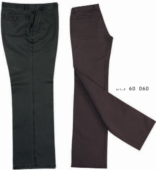
art.# 60 060