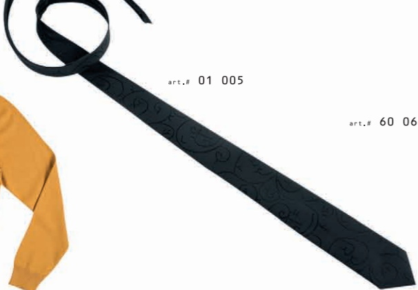
art.# 01 005