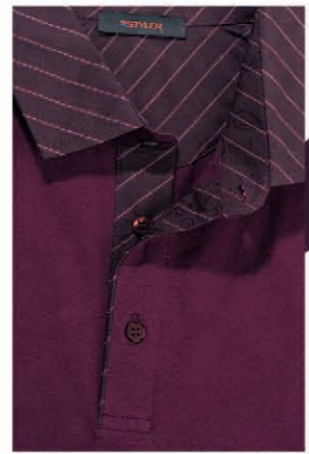
art.# 40 140