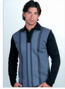
art.# 18 042