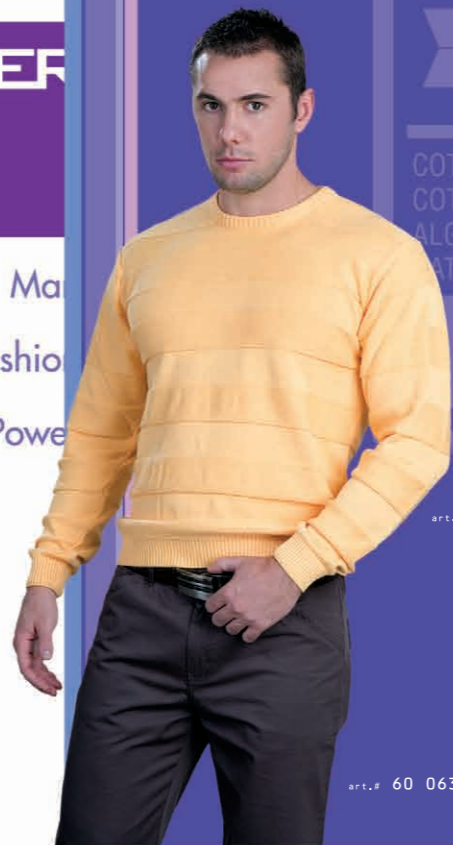
art.# 38 033