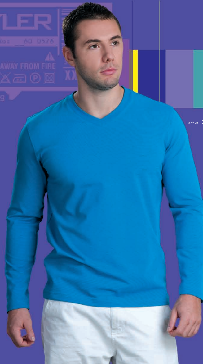
art.# 39 144