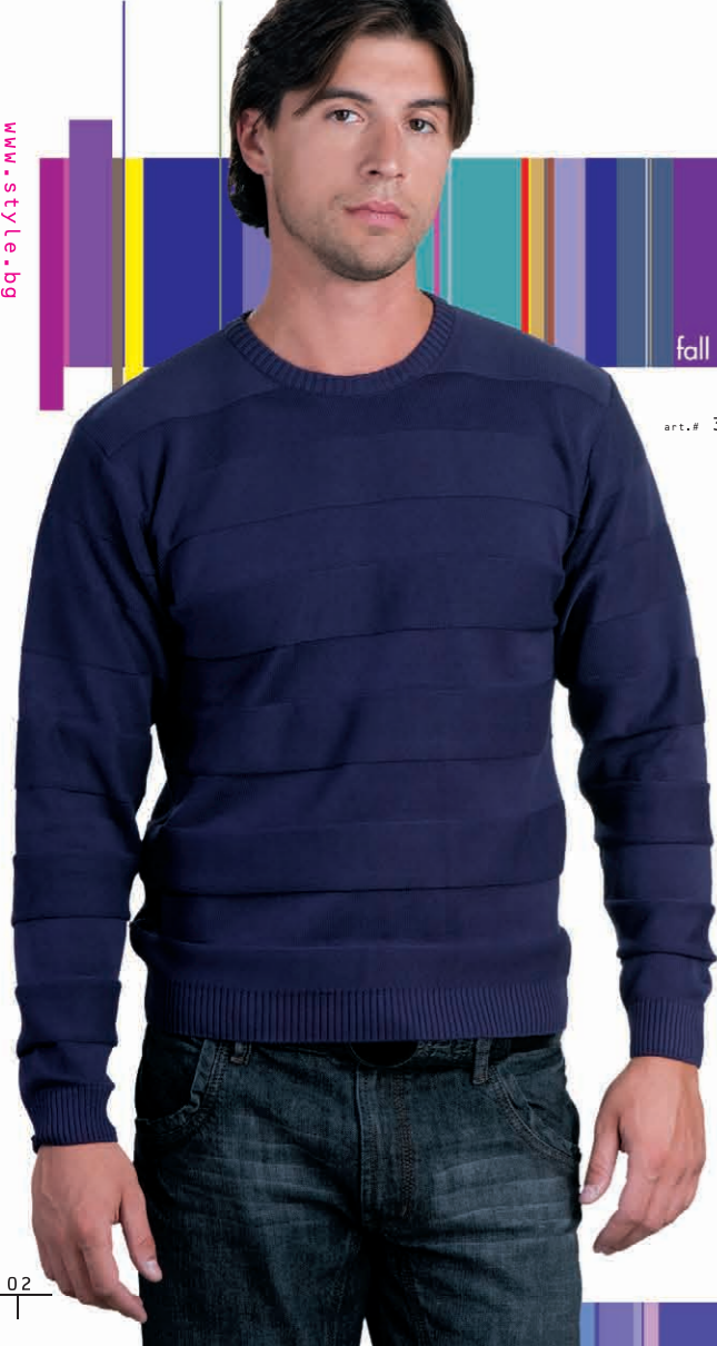
art.# 38 036