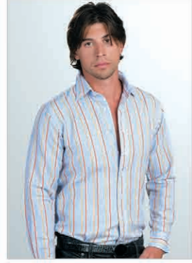
art.# 21 005