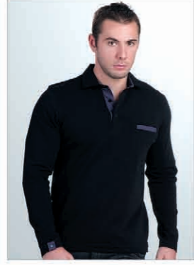
art.# 40 135