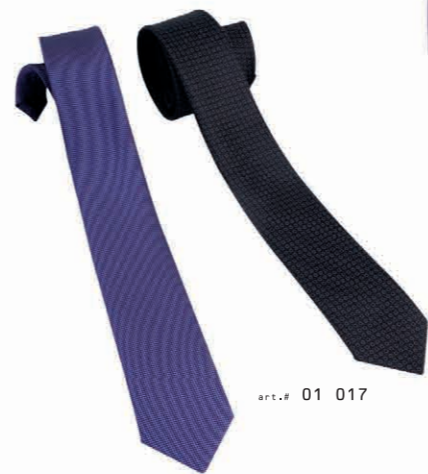
art.# 01 017