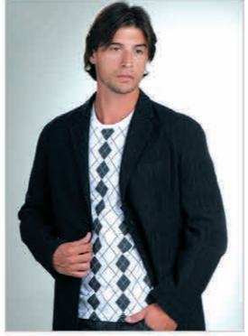
art.# 61 015