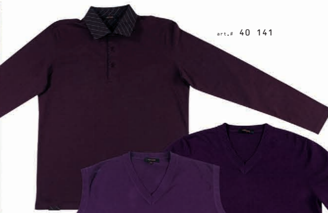
art.# 40 141