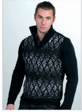
art.# 14 051