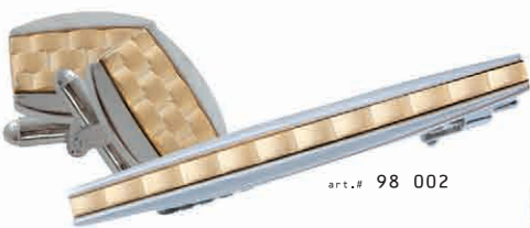
art.# 98 002