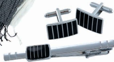
art.# 98 002